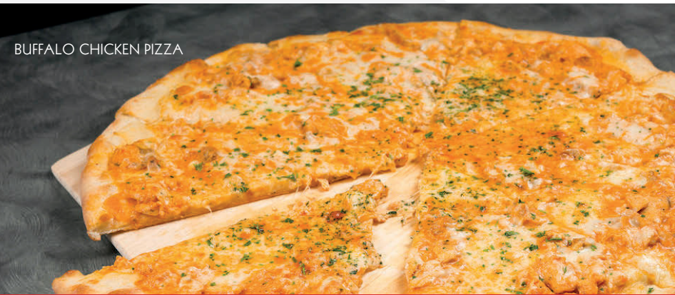
BUFFALO CHICKEN PIZZA