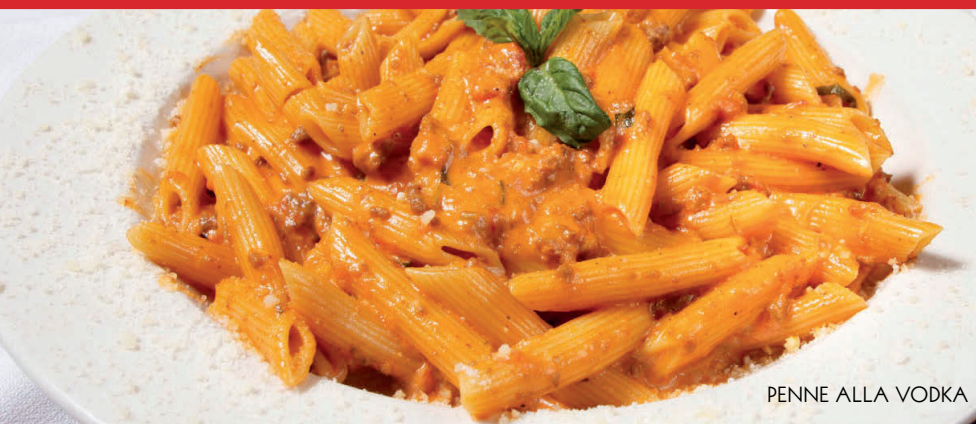
PENNE ALLA VODKA