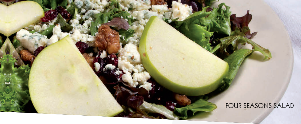
FOUR SEASONS SALAD